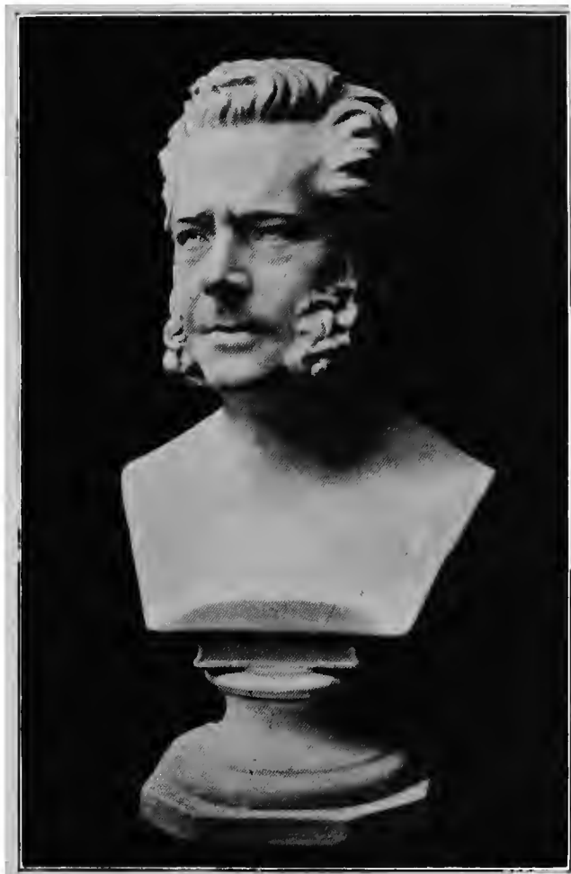
Bust of Ibsen, about 1865.